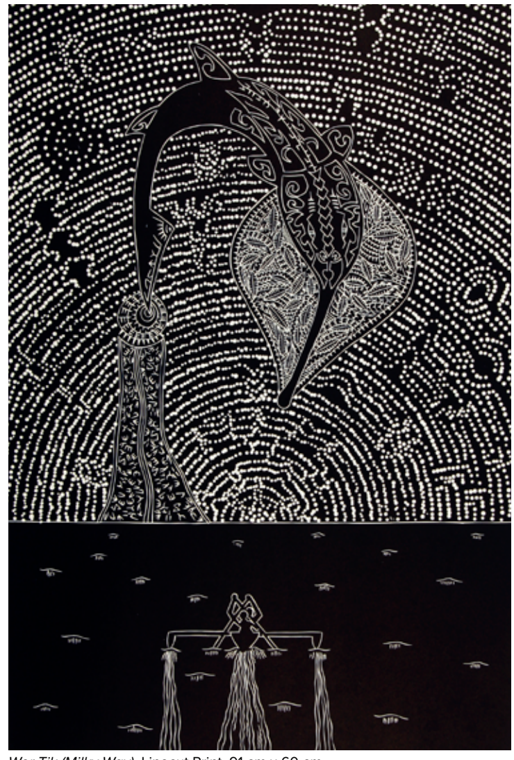
Wer Tik (Milky Way), Linocut Print, 91 cm x 60 cm