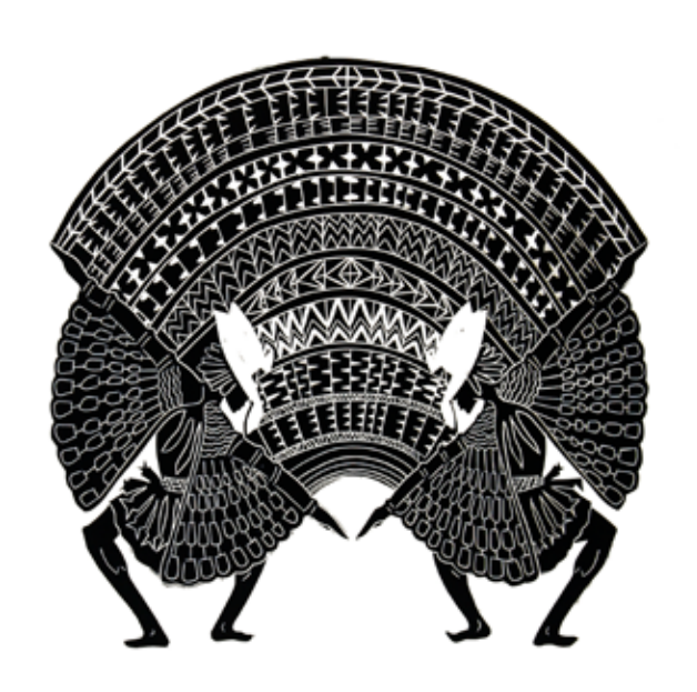
Wal (two crew of Tagai), Linocut Print, 30 cm x 30 cm