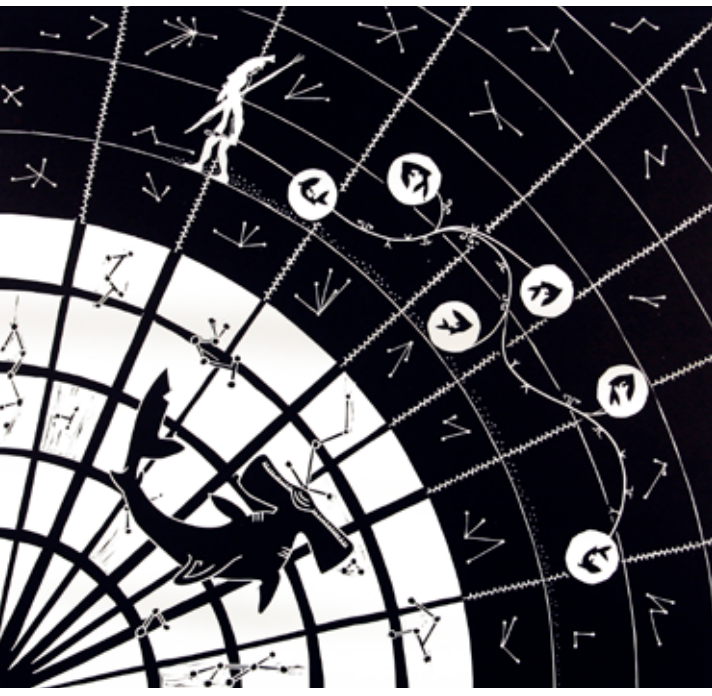
Seg (Orion), Linocut Print, 66 cm x 63 cm