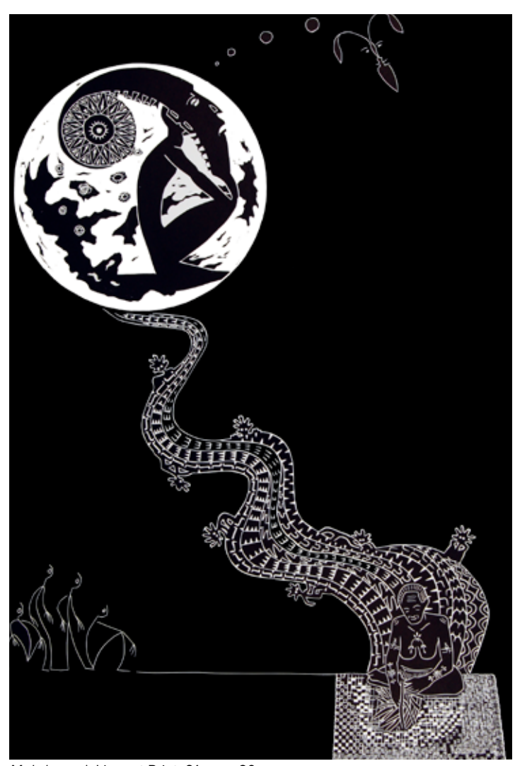
Meb (moon), Linocut Print, 91 cm x 60 cm